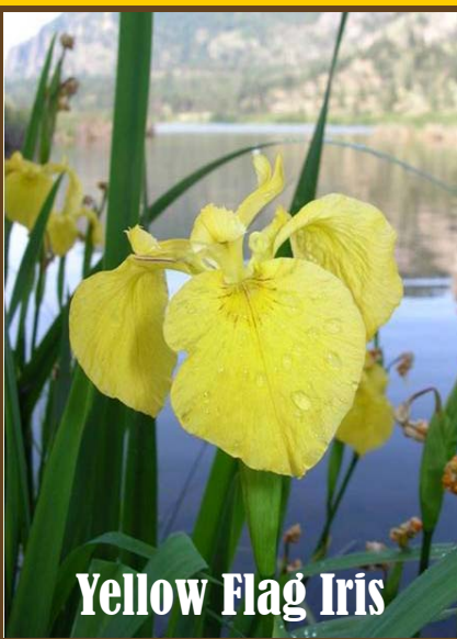
Yellow Flag Iris